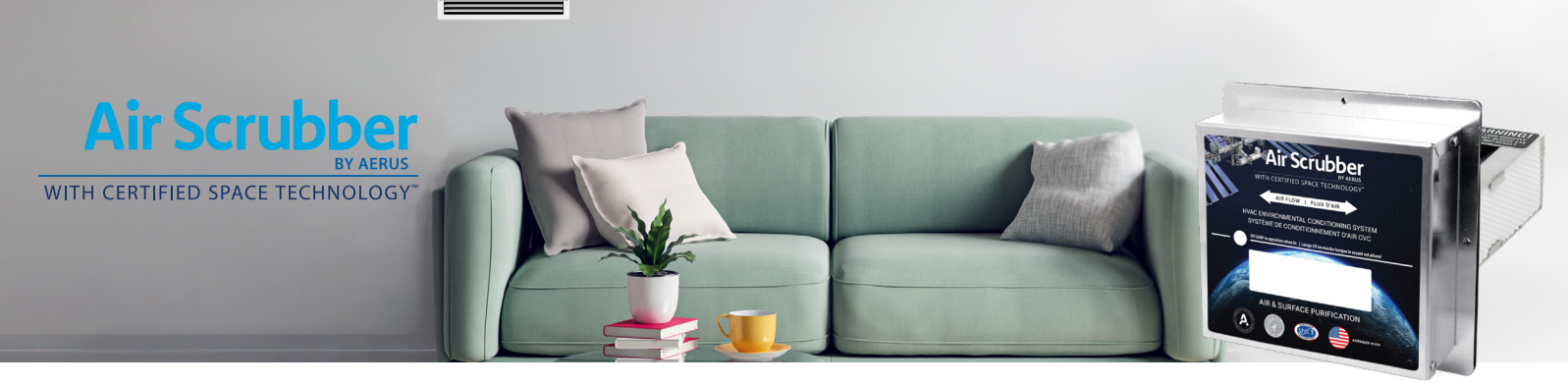
New Patented Cell Design